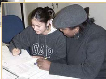
...and in the spring of 2003